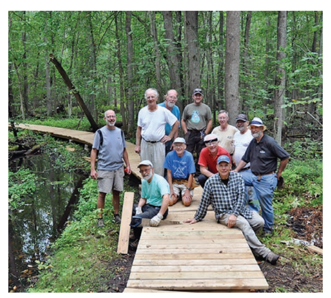
lacktriangle An opening ceremony was held on May 11 to celebrate the work of Friends of Hibou who completed a 200-foot boardwalk over a wet stretch of trail in Hibou Conservation Area, part of Grey-Sauble Conservation Authority. The boardwalk was finished last fall with a grant from TD Friends of the Environment.