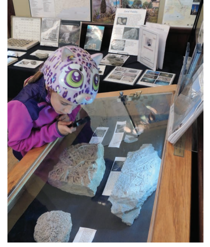
\blacktriangle One of many visitors, this girl studied the Niagara Escarpment fossils on loan from the Royal Ontario Museum (ROM) on June 6, the first weekend they were on display at the Giant's Rib Discovery Centre in Dundas. The Centre will feature more fossils from ROM on a rotating basis.