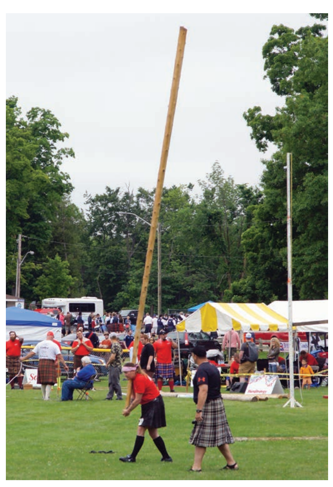
\blacktriangle A competitor in the Caber Toss at the 40th annual Georgetown Highland Games, June 13.